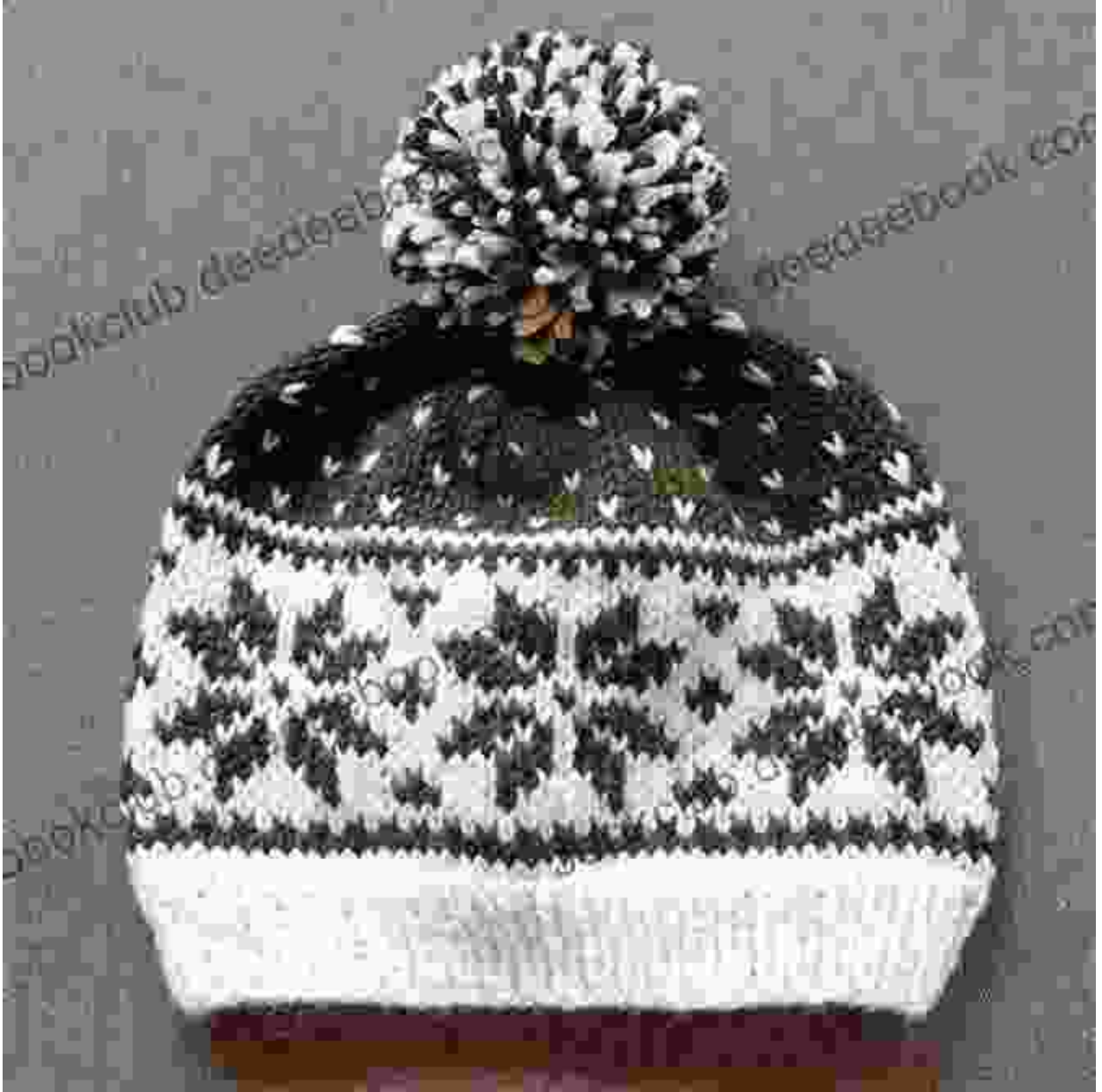
▪ Fair Isle Hat