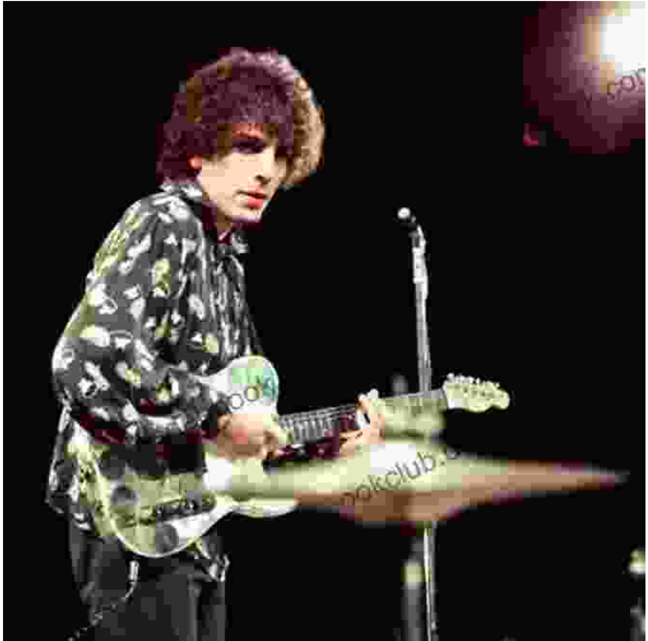
A Saucerful of Secrets (1968)