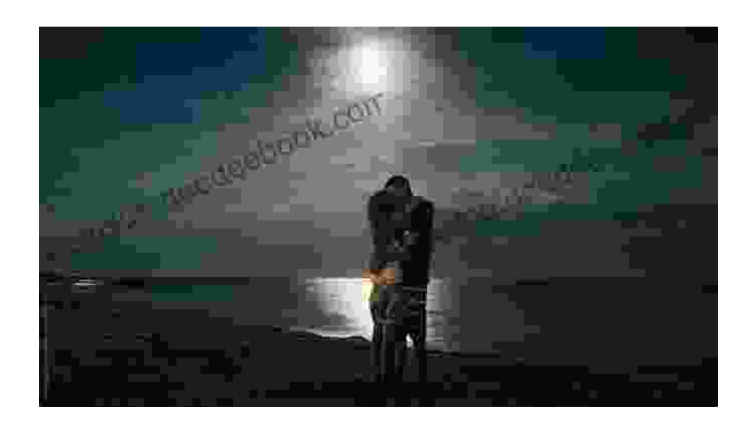
Chapter 3: The Forbidden Love

As their fake relationship blossomed into something deeper, Amelia and Ethan found themselves torn between their hearts and the expectations of the small town.