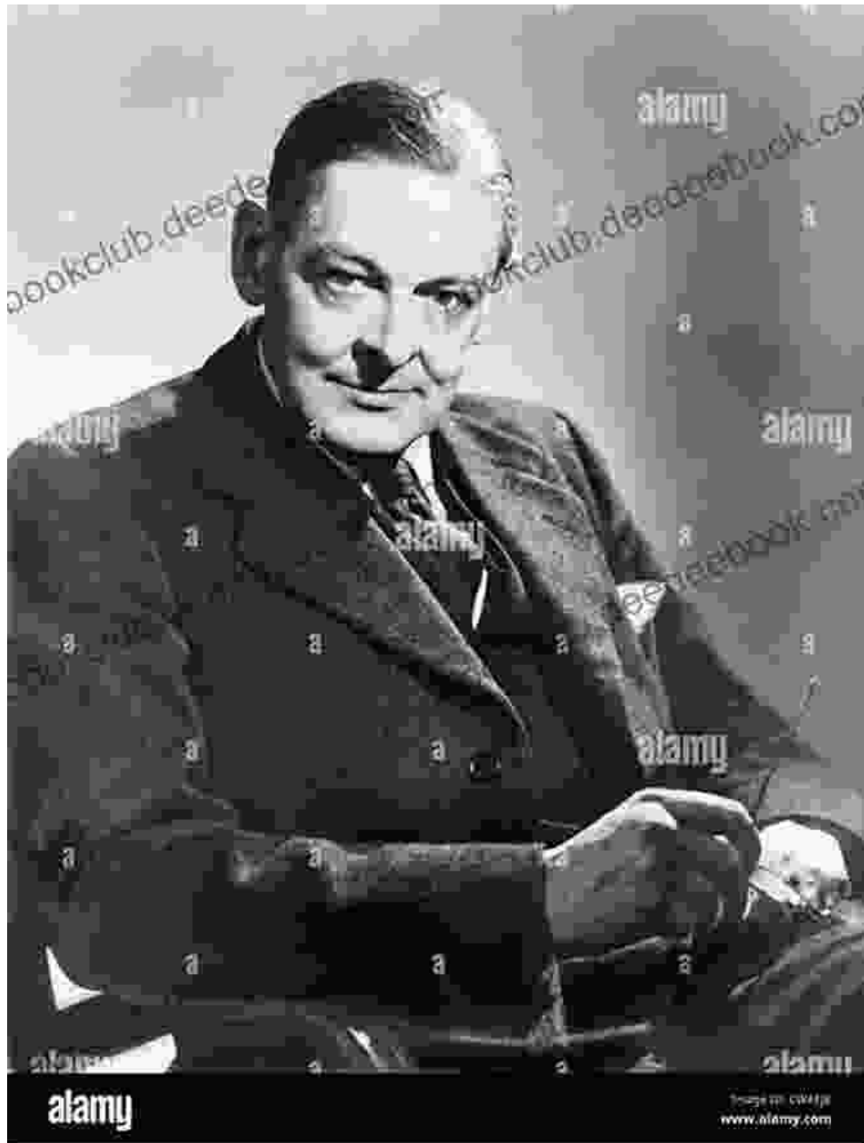
Figure 2. T.S. Eliot, a literary giant who delved into themes of fragmentation and alienation.

Eliot's poetry evokes the fragmented experiences of individuals lost in a labyrinth of modern life. His use of symbolism and allusion draws from Jung's archetypes, exploring the collective fears, desires, and anxieties of the human condition. Eliot's work not only captures the psychological