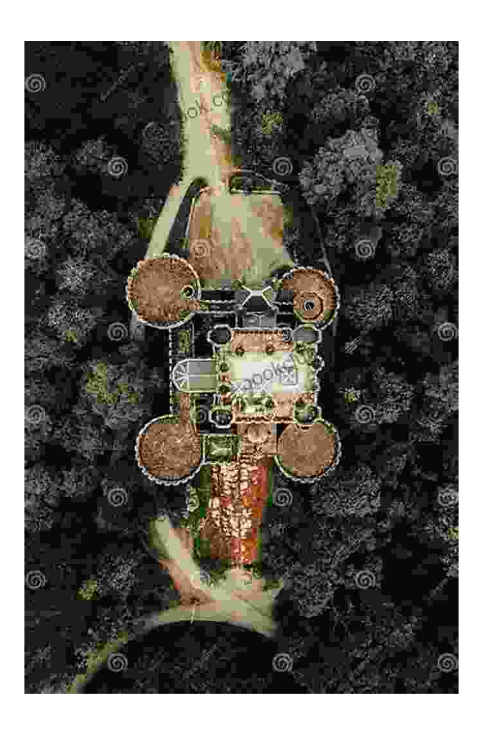
The Adventures of Obi and Titi: The Hidden Temple of