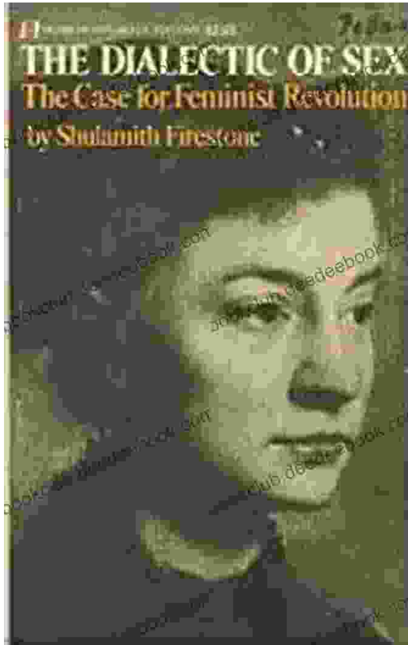
Shulamith Firestone, author of The Dialectic of Sex

Shulamith Firestone's book The Dialectic of Sex is a seminal work of feminist theory that explores the historical and social roots of women's oppression. Firestone argues that the division of labor between men and women is the root of all gender inequality, and that the only way to achieve